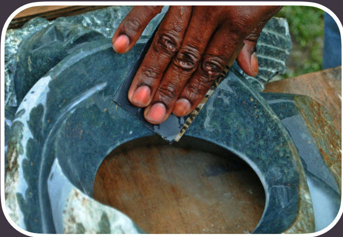
Polishing waterproof sandpaper